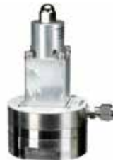
LRP WITH REGULATOR