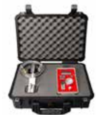
PROTECTIVE CARRY CASE