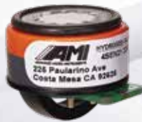
WIDE RANGE H 2 S SENSOR