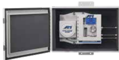
EXTREME WEATHER ENCLOSURE

For applications in extreme cold weather down to -40°F or harsh environmental conditions.