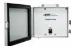
FIXED SAMPLE PUMP

Sample pumps draw sample in ambient pressure applications or pressure down to -7 psig. Designed to meet Class I, Div 2, Groups C & D requirements.